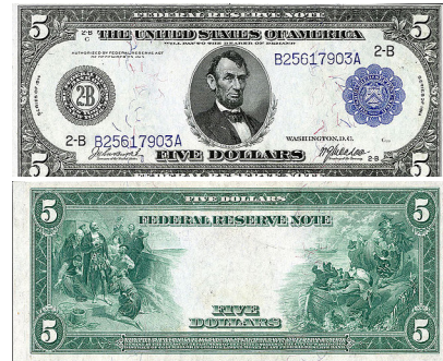
Federal Reserve Note in 1914

a ringing sound (hence the term “sound money”). Now, the Fed would not be allowed to increase the money supply by simply issuing more notes (i.e., printing money), the law required 40% of the face amount of all outstanding Fed notes to be backed by gold. Thereby, an increase in money supply required at least a partial increase in gold reserves.